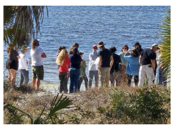
Archaeological Survey Resumes

Ever want to try your hand at vintage letterpress? Now here is your chance! Taught by 3 of our supremely skilled printers with a combined 23+ years of knowledge. In this class, limited to 4 attendees, you will learn print shop rules, setting type, using the 1915 Chandler & Price press, and more. This is an introduction to letterpress and attendees will be using the museum print shop's historic collection of monotype and plates. You will leave with cards you have printed (plus envelopes), and a complimentary print shop apron with our new logo. The class will be held on Saturday, March 23<sup>rd</sup>, from 1:00PM until 4:00PM. Preregistration and payment is required by Wednesday, March 20<sup>th</sup>. Cost is $75 per person. Stop by the museum at 1134 Beck Avenue or call 850-872-7208 to register.